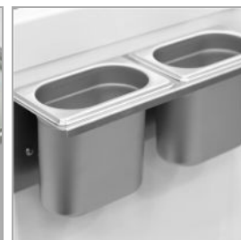
Scoop wash option