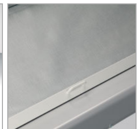
Rear night curtain to maintain temperature