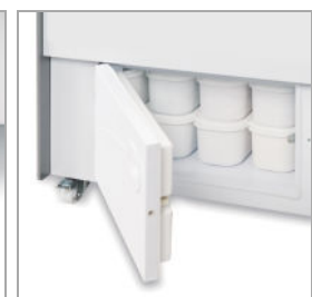
Easy access storage compartment